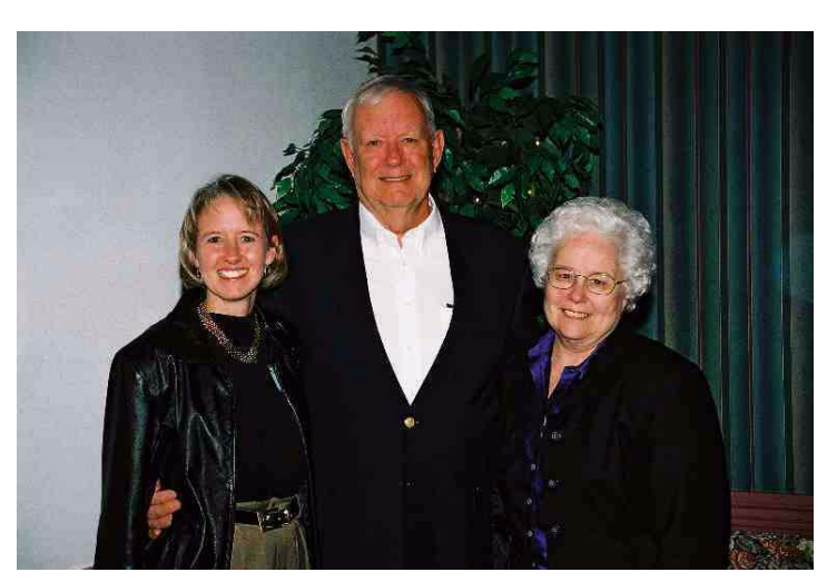
The Denton Family