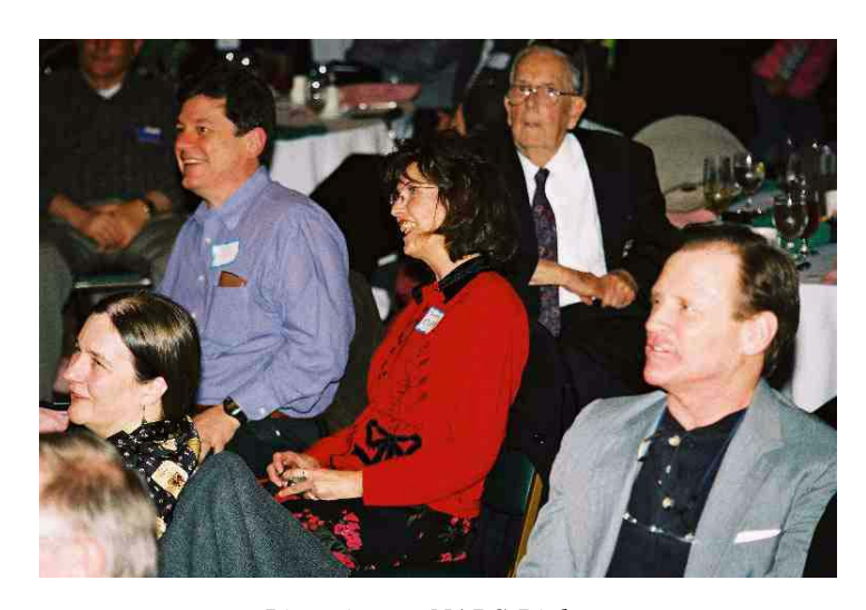
Listening to NARS Pickers