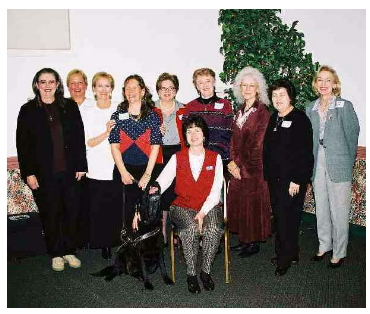
Ham and Sheez Group