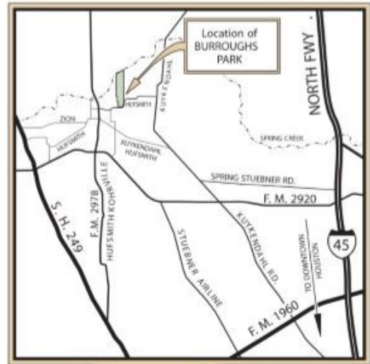
INSERT MAP Not To Scale