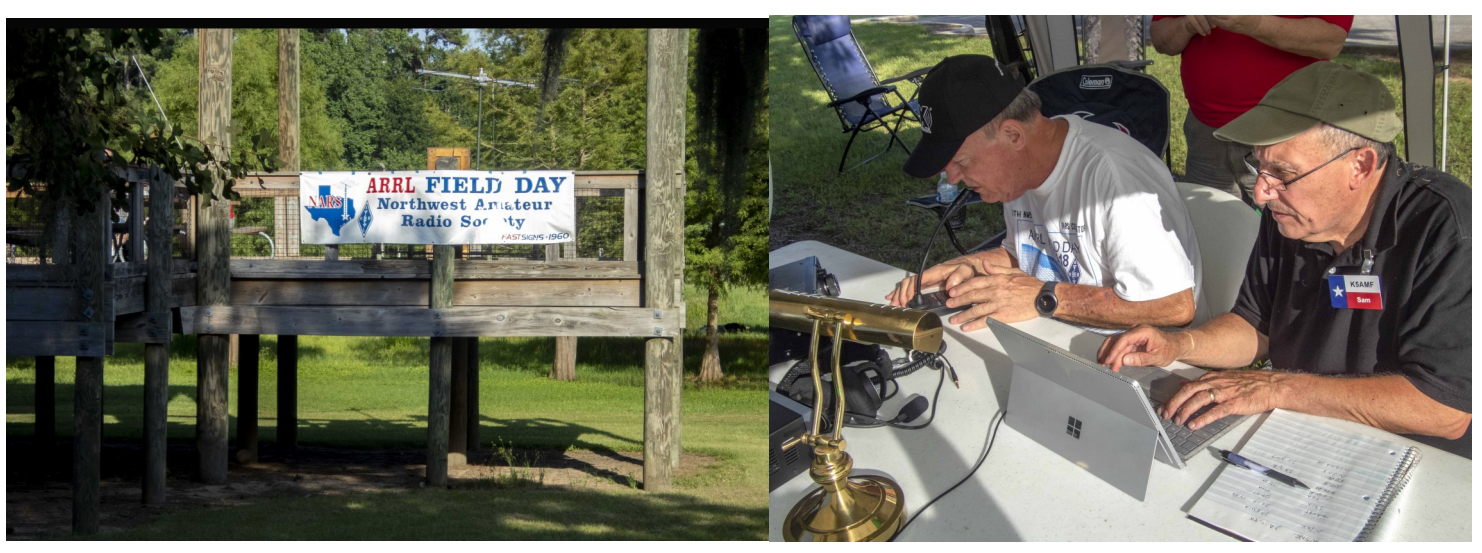
Operating SSB and logging.