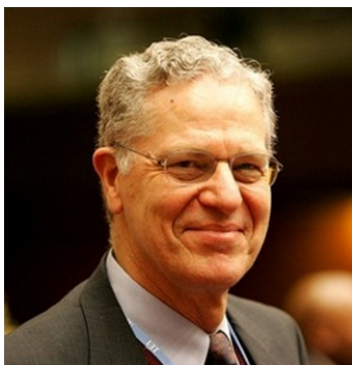
Joe Taylor, K1JT.