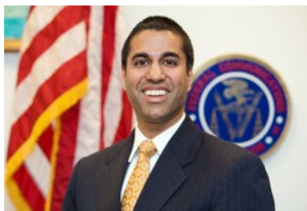
FCC Chairman Ajit Pai.

President Donald Trump named the 44-year-old telecommunications attorney -- who