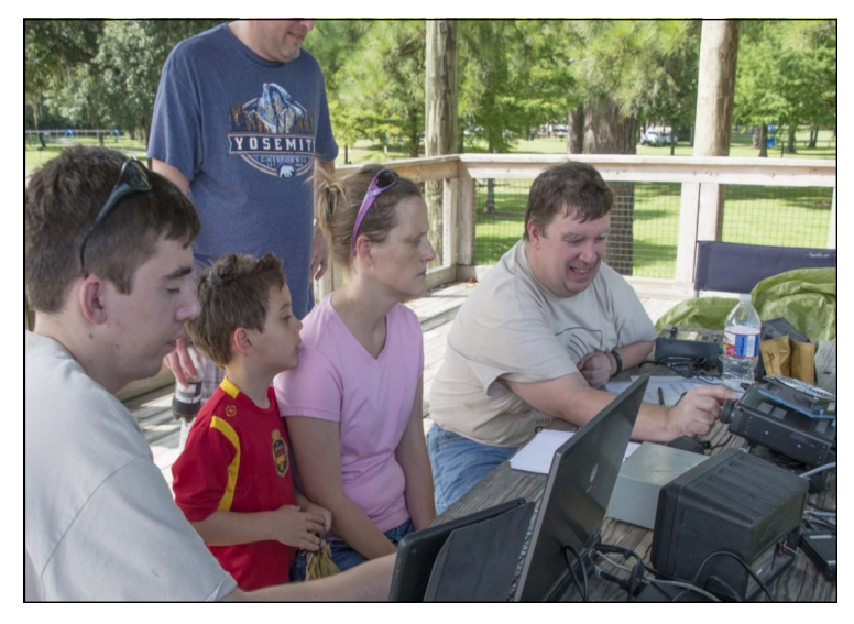
A glimpse of Field Day 2016 Burroughs Park