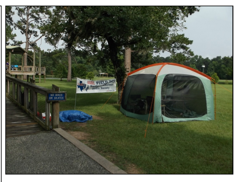
Ah, yes.... The calm before the storm!