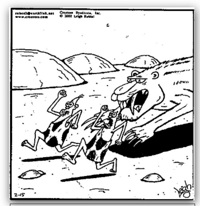
"And to think, up to now, I always thought my biggest fear was making my first CW contact on 20 meters!"