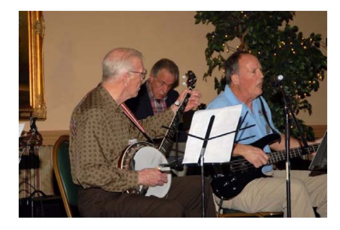
The NARS Pickers!