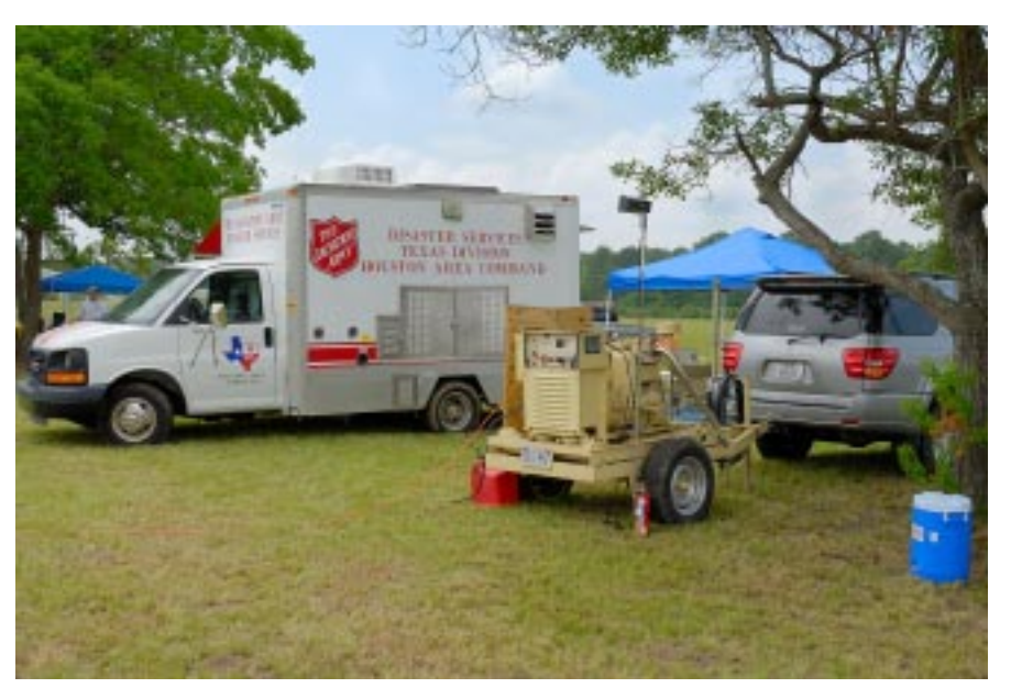
The Salvation Army Disater Services Mobile Kitchen provided the coffee and cooked the hot dogs while Old Genny provided the power.