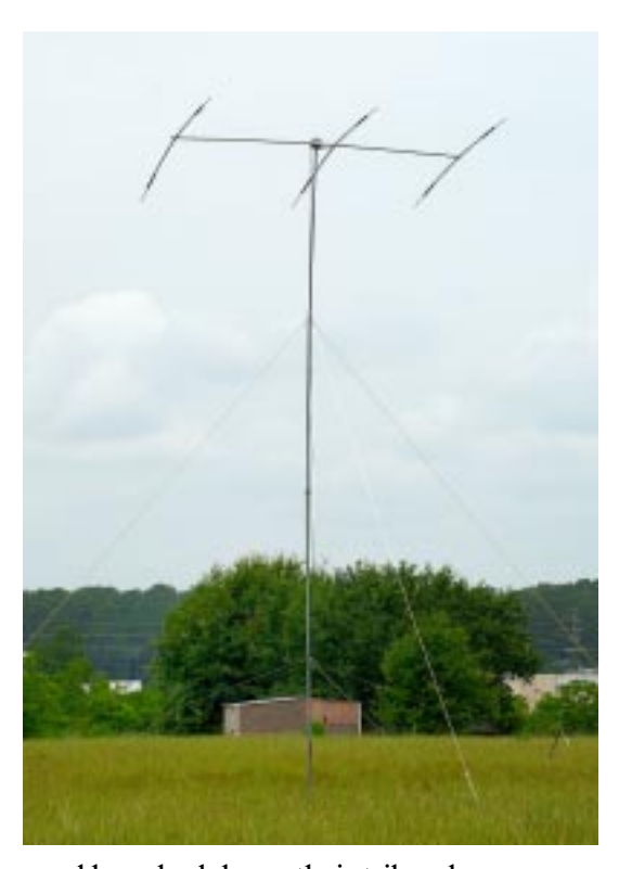
The crew at the SSB station making a run before the winds came and knocked down their tribander.