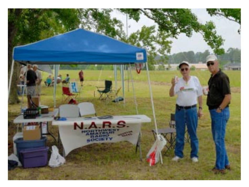
The usual NARS Welcome Tent and a couple of the regulars.